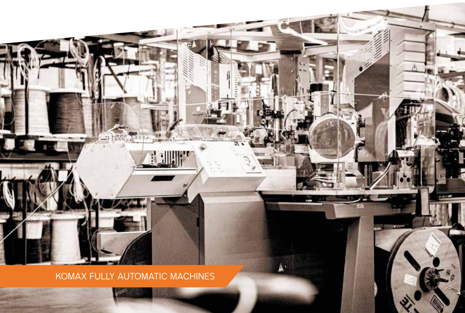
KOMAX FULLY AUTOMATIC MACHINES

Cable assembly means the production of cables or cable harnesses with contacts and connectors and, if required, sheathing to form ready-to-install and ready-to-connect assemblies for vehicles and machines. Pre-assembly is largely fully automatic, thanks to our extensive fleet of machinery including fully automatic machines, automatic crimping machines, automatic twisting machines, ultrasonic splicing technology, connector and cable printing, automatic taping machines and yarn knitting machines. Subsequent installation is carried out in table and cable board production. We manufacture at various international locations and therefore offer economical solutions for every application.